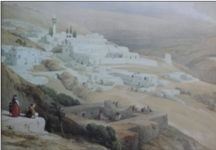
View of Nazareth by David Roberts 1839

In the Gospel record of Luke we learn that after Joseph and Mary had taken the baby Jesus to the Temple in Jerusalem to carry out purification rituals required by the law, ‘...they returned to Galilee, to their own city, Nazareth. And the child grew and became strong in spirit, filled with wisdom; and the grace of God was upon him.’ [Luke 2.39,40]. When we think about some of those words in this verse that describe Jesus as ‘strong’ and ‘wise’ with the ‘grace of God upon him’, we have an insight into what the people of Nazareth must have witnessed and experienced, as this Son of God grew up as their neighbour, through his childhood into adolescence and manhood.