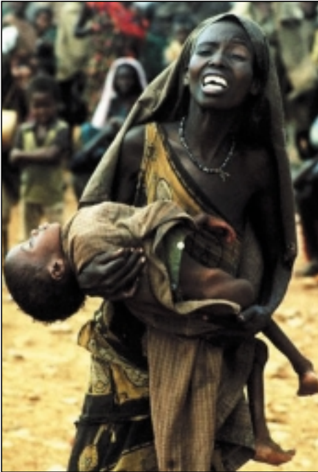
Somali mother and dying child

The gap between rich and poor not only gets ever wider, fewer people control the bulk of the world's wealth and an ever increasing part of that wealth is owned by multinational corporations. Approximately 842 million people go hungry each day. Most of these live in third world countries, but 10 million live in rich industrialised nations.